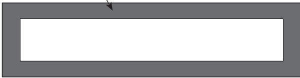
Figure 1 - Evenly Apply Adhesive to Back of Surround Face (Back View Shown)